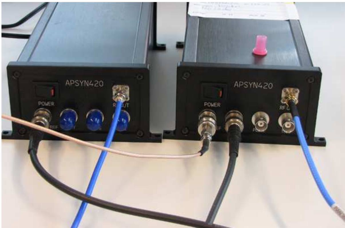
Figure 1: Test setup

Figure 1 shows the test setup to determine the level of phase stability (coherence) between two APSYN420C frequency synthesizers programmed to 16 GHz output. An APPH Signal source analyzer is used to monitor the phase stability between two RF channels over a long time interval, in this case approx. 9 hours.